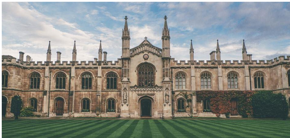
Figure 1 Destination Cambridge University for some of my former IELTS students!

During this time I have developed my own strategies and techniques that help students get the best possible IELTS band score in the shortest possible time.